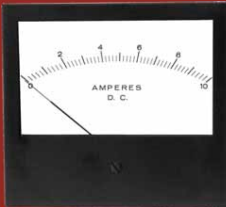
680 - D.C Moving Coil 681 - A.C. Repulsion