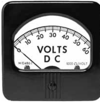
597 - D.C Moving Coil 598 - A.C. Repulsion