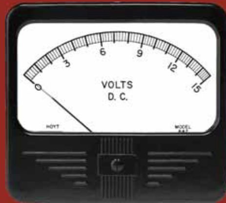
647 - D.C Moving Coil 648 - A.C. Repulsion