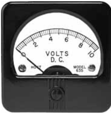
635 - D.C Moving Coil 636 - A.C. Repulsion