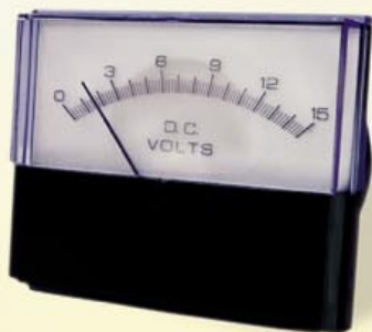
Outdated incandescent lamp backlighting is uneven, with hot spots and shadows.

contains a precision diecut dial and lighting panel, and inverter power supply, which is powered by your existing lamp power source. The diecut panel is simply installed behind a new translucent scale plate and connected to the inverter power supply. For new applications , Hoyt panel meters can be ordered with the ELumination lighting package factory-installed.